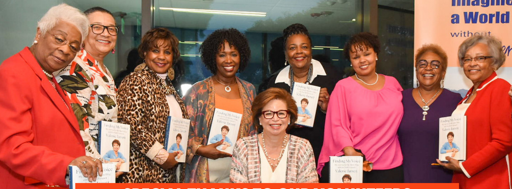
SPECIAL THANKS TO OUR VOLUNTEERS